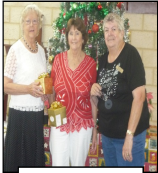
First Aid Officers